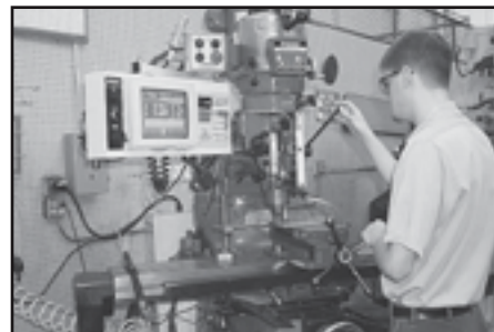
Max Daetwyler's Apprenticeship 2000 is a state certified school-to-work program offering qualified individuals the opportunity to earn while they learn.

Each apprentice graduate has an important career start, plus four years of on-the-job work experience and a full-time job with their sponsor company. This is truly a rare and invaluable opportunity. For more information, contact any partner company or visit www.apprenticeship2000.com .